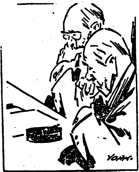
"What worries me as a politician is that the silent center is beginning to pop off."